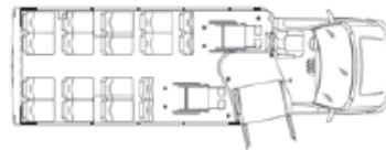
26', 14+4 Passenger, 2 w/c