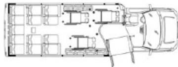
26', 13+7 Passenger, 3 w/c