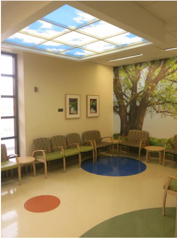
View of existing lobby space, to be converted to Teen Room