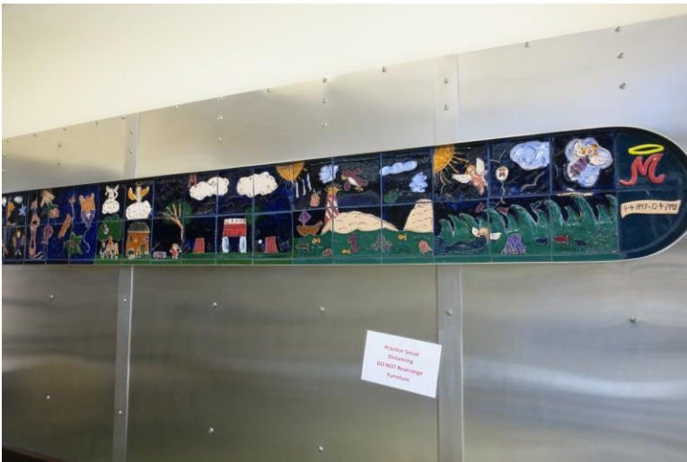
Front view of tile accent to be removed and reinstalled.