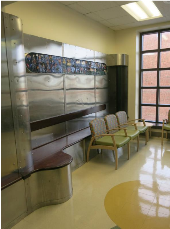
Tile to be removed and reinstalled, stainless steel wall to be partially demolished.