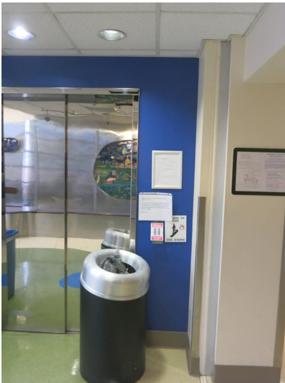
Existing elevator entry to be removed.